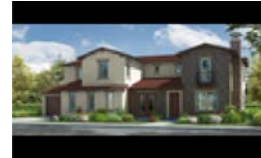
Elevation Residence 3C

See New Home Consultant in this community for more details!