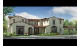
Elevation Residence 4A

Family Room, Dining Room, Living Room, Den, Office, Bonus Room, 4-Bay Garage