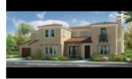
Elevation Residence 3B