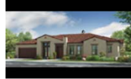
Elevation Residence 1A

Great Room, Dining Room, 3-Bay Tandem Garage