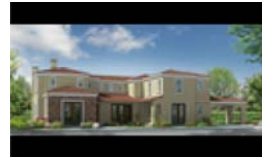
Elevation Residence 4B