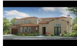
Elevation Residence 2B