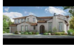
Elevation Residence 2A

Great Room, Dining Room, Living Room, Office, Sitting Room, Interior Courtyard 3-Bay Garage