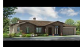
Elevation Residence 1C

See New Home Consultant in this community for more details!