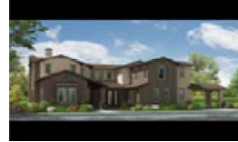
Elevation Residence 4C

See New Home Consultant in this community for more details!