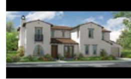
Elevation Residence 3A

Great Room, Dining Room, Office, Bonus Room, 3- Bay Garage