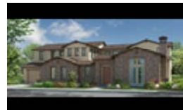
Elevation Residence 2C

See New Home Consultant in this community for more details!