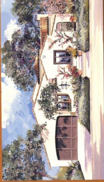
Elevation BR (Model)