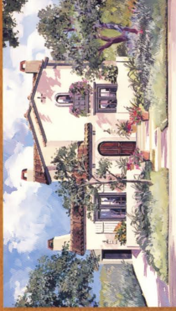
Elevation A (model)