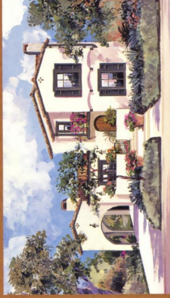
Elevation B (model)